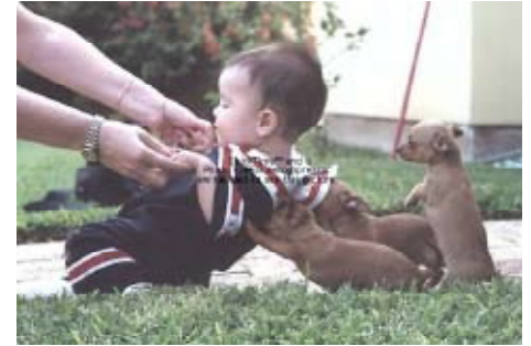
Some puppy power. "Hold him up guys"

County wide youth fest from 12 - 5 at the Pittsfield Common on First Street in Pittsfield.