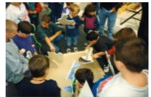
Who are these youngsters and what are they doing?