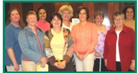
Participants of the October "Food and Fuel" Coalition Forum pose for a photo following the energetic discussion

October's forum on the rising costs of food and fuel appeared to strike a nerve in our community, as 98 community members crowded into the community room of the North Adams First Baptist Church on October 10th. The goal for this forum was to establish what resources we have to address food/fuel needs and then to go one step further to identify gaps that might exist amongst these resources. The group also had an eye toward how organizations currently or could potentially connect in order to cover gaps. This well-attended meeting was buzzing with energy, as the room was packed and nearly everyone was eager to contribute ideas and resources to the conversation.