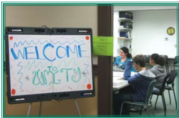
Early arrivals get ready to greet new members of the Youth Leadership Program