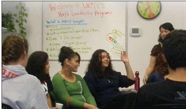
▲ Members of the YLP get to know one another.