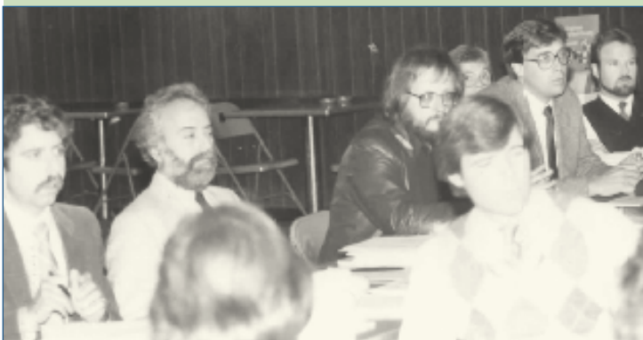
▲ We've grown, we've grayed over the past 25 years. Recognize anyone?