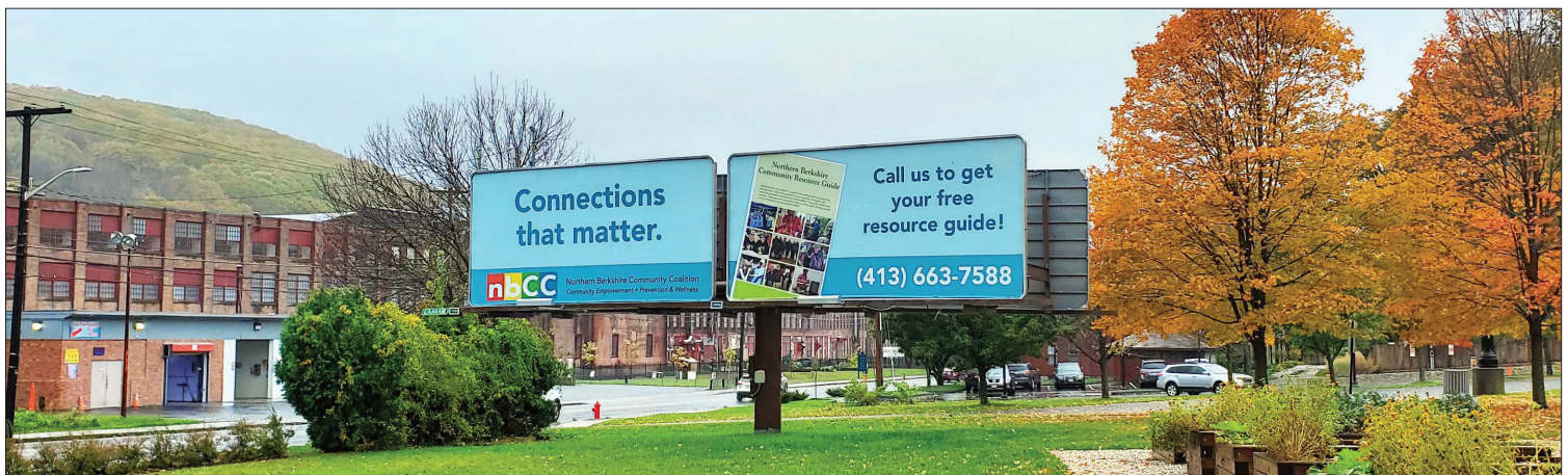
▲ Check out our new billboard at the UNO Park on River Street!